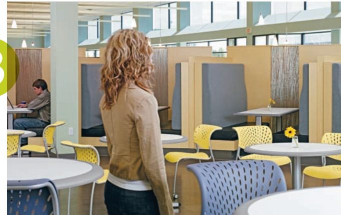
3 Hannah chair and Rylee table