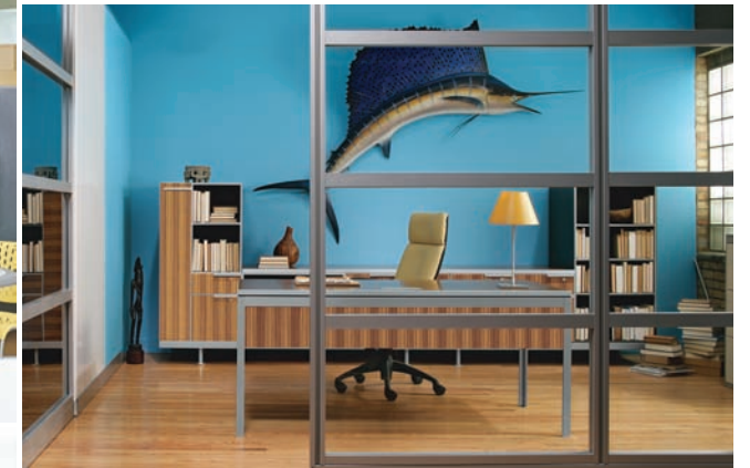
2 Audrey table, storage, and Hollie chair