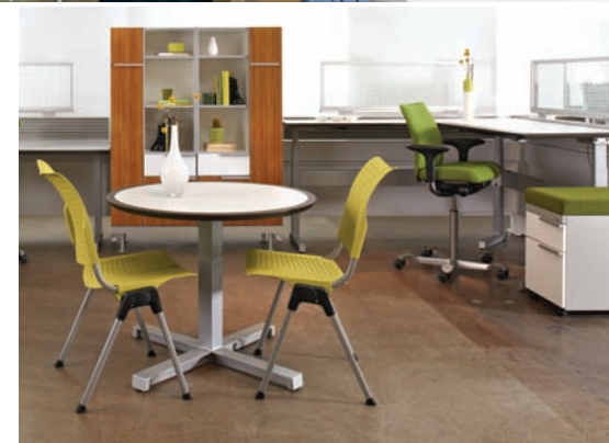
1 Audrey storage, Edison post and beam, and Rylee tables

3-2-1 spaces offer something for everyone.